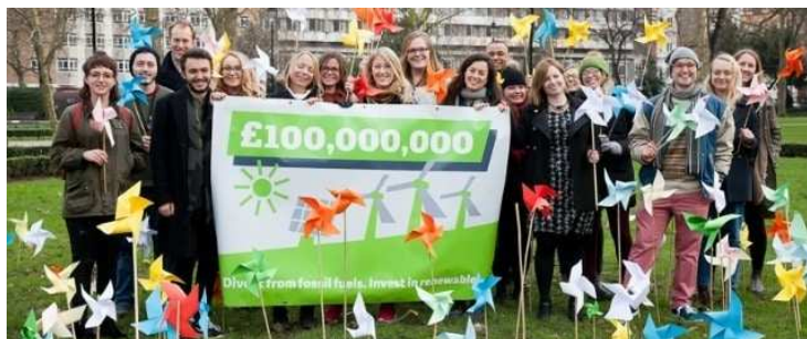
Launch of Divest/Invest campaign at SOAS, the first London based institution to divest. Jan 2016

In 2015/16 the Green Impact campaign worked in partnership with students' unions and over 179 organisations including, community organisations, NHS Trusts, local councils, and fire brigades. The partnership consisted of over 1,075 organisational teams encompassing 19,916 staff, approximately 3,202 of whom sat on local Green Impact teams. To date the scheme has delivered 256,491 actions, 46,743 as a direct result of the scheme, and this year we have trained over 500 students as volunteer auditors or in supporting teams throughout the programme as a project assistant.